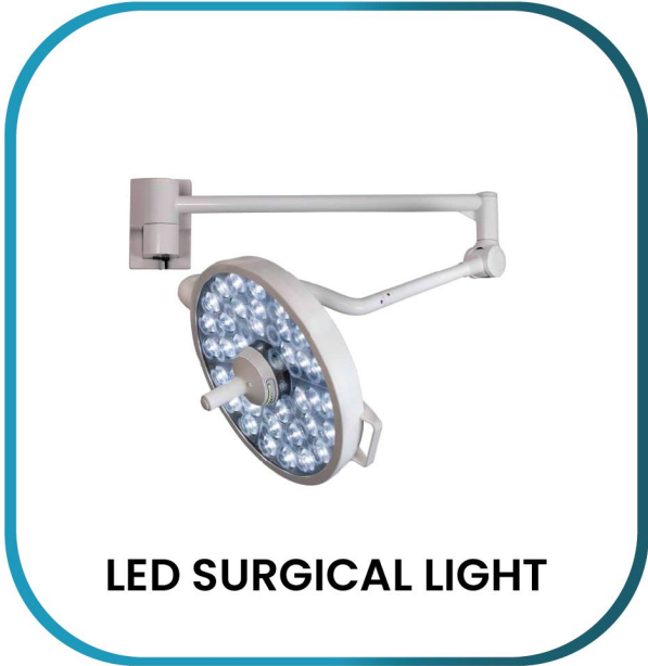
LED SURGICAL LIGHT