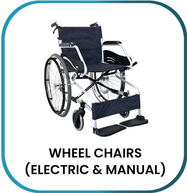
WHEEL CHAIRS (ELECTRIC & MANUAL)