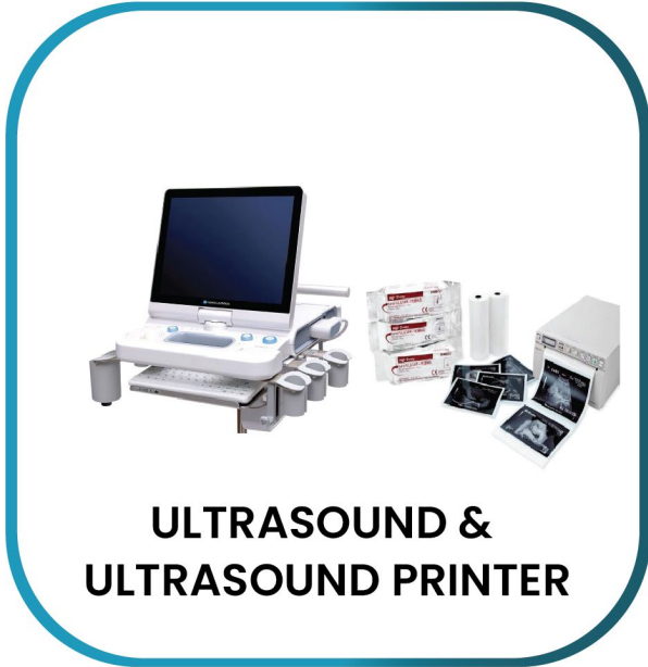
ULTRASOUND & ULTRASOUND PRINTER